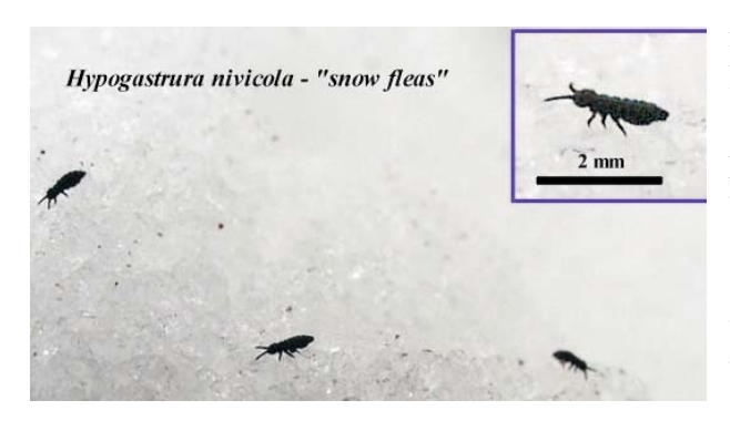
days. They jump by releasing a fork-like appendage (the furcula) on the underside of their abdomen..

In February or early March, not all the black flecks on the snow surface are dirt! Some are snow fleas, somersaulting through the air, revelling in the warmth of the lengthening