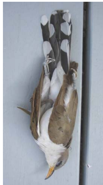
Yellow billed cuckoo found by the side of US Hwy.M- 129 16 miles south of SSM MI, June 26, 2007 – breeding season. Listed as Very Rare.