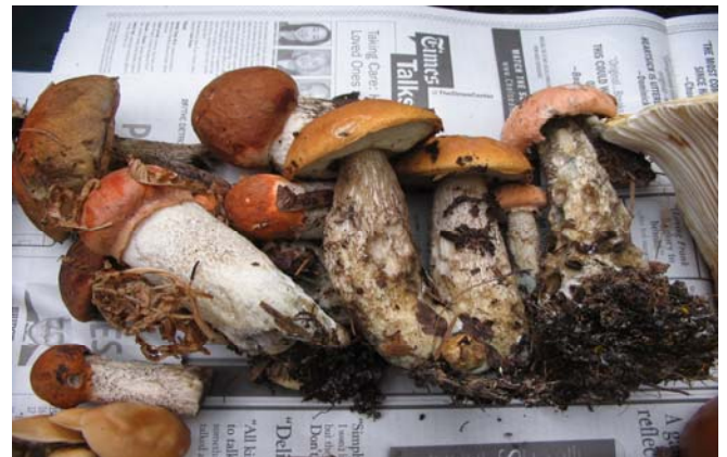
Fungi from Detour outing. Sept. 07.