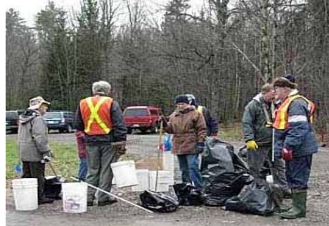
Wishart Park. Nov 10.