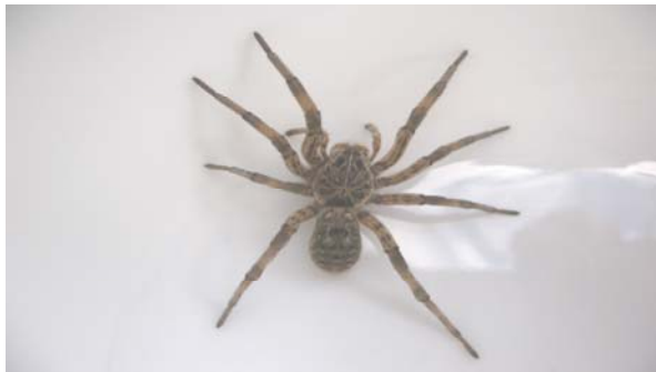
Dark fishing spider.

At the state prison where I work, 20 miles south of SSM, Michigan, one day this past September, an inmate informed health services that he had awakened to find a spider on his face and that the spider had bitten him. The doctor examining him found swelling and localized inflammation on his face, consistent with a spider bite, but later (when I had an opportunity to question him) said that it looked like a chronic case of acne more than anything else. It is surprising that the spider was captured and brought to health services alive and intact in a plastic jar with air holes neatly punctured in the cap. The spider was given to me, as no one else seemed to want it (imagine that!).