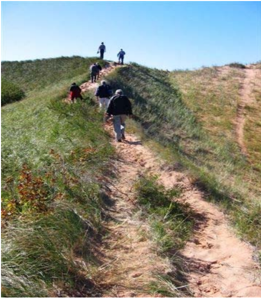
Walking a blow-out at Pictured Rocks National Lakeshore Park. Sept. 07.