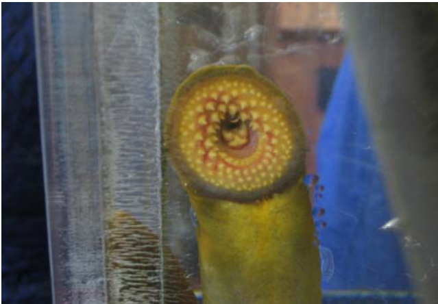
Lamprey in aquarium at Ontario MNR lamprey research building, Locks Park, 06/27/07 outing tour.