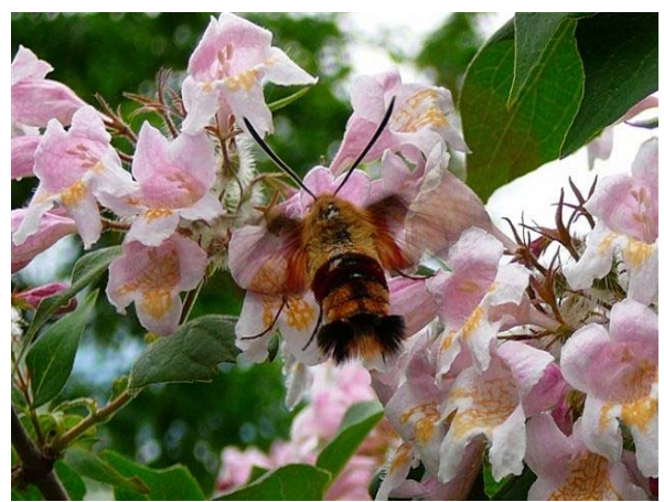
Clearwing hummingbird moth. Aug 07