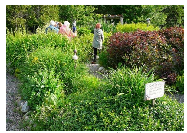
Belleau gardens. June 07.