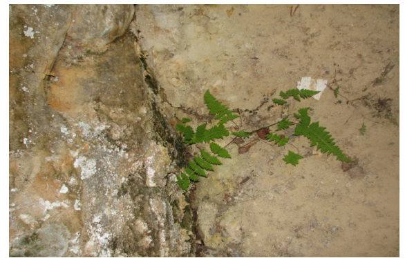
Cliffbreak fern. MNA cave Munising.

Next stop was in Munising where we walked into a small Nature Reserve owned by the Michigan Nature Association. This Reserve contains a gentle waterfall, A canyon-like descent behind the waterfall led us to see one of the cliff brake ferns Cryptogramma stelleri . thriving on the dry, edges of a breathtaking cave wall.