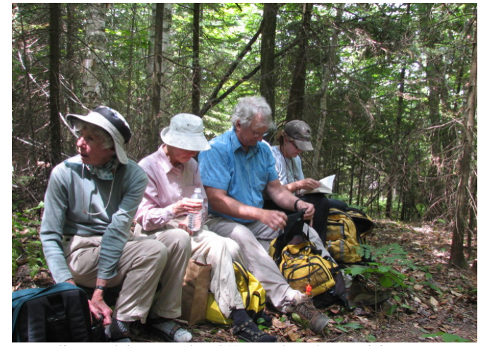
Naturalists studying on a break!! Lunch at the Munising MNA waterfall. Photo by D. Euler Aug. 07