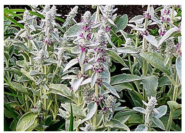
Lamb's-ears in beautiful Belleau Gardens. Sault Naturalist and Horticulturalist Outing. June 20/\ 07