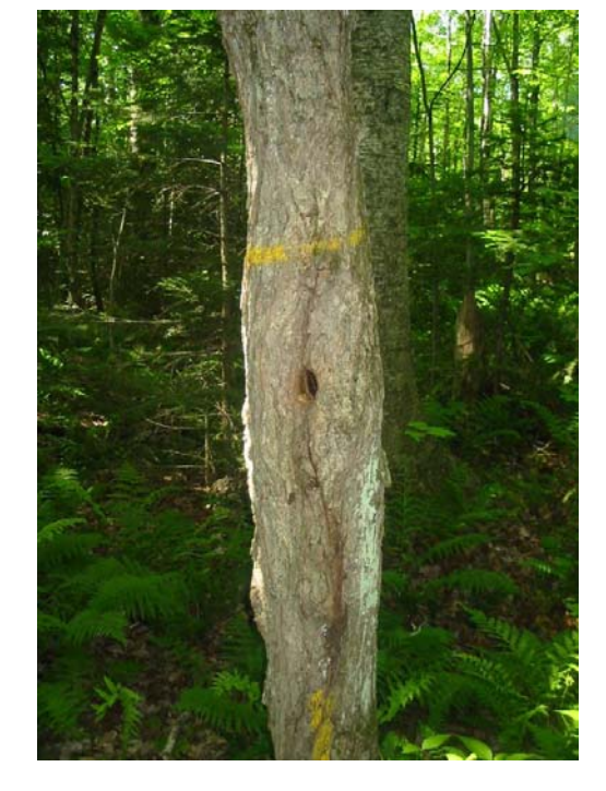
The "Critter Tree"

We would like to thank the many club members who put so much effort in to the inventory project. Many