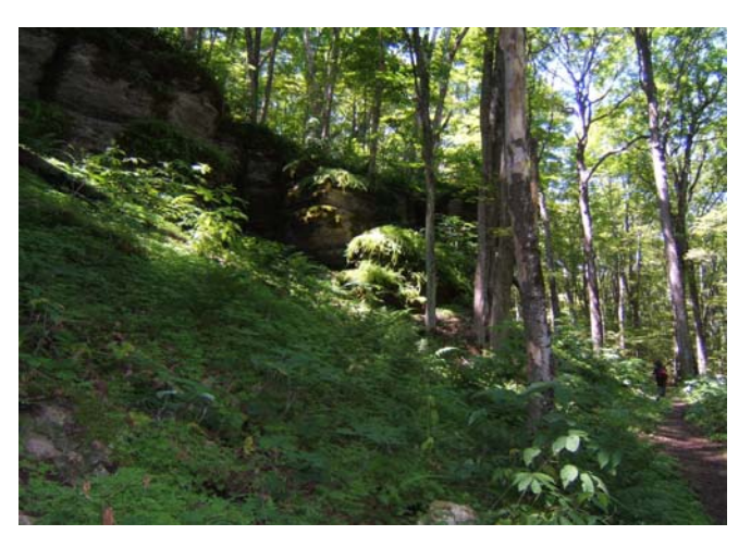
The Atrium. July 21/07 Fern outing.